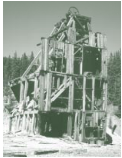
THE SILVER LEDGE HEADFRAME will be stablized with funding obtained from the Colorado State Historical Fund.

As part of its outreach mission to local communities, Community Services helped the Red Mountain Task Force to prepare the grant