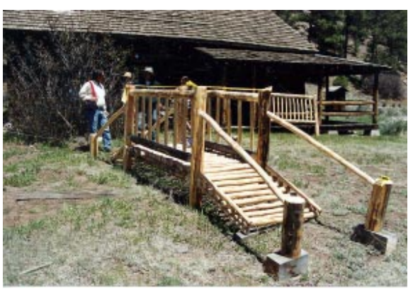
A bridge in Vallecitos, NM, built of small-diameter timber dipped in borate preservative, is one experimental product among others.

Last year, Lynch's proposal to teach design and construction techniques needed to utilize small-diameter timber in structural and decorative trusses was accepted by the FCSFP. The project has involved harvesting green logs, preserving