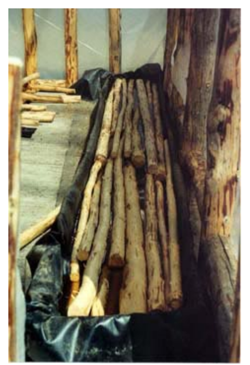
Project members hope that green logs soak in a borate-based dip will provide an alternative niche product to toxic preservations used in the US.

"We're promoting borate-treated materials as a safer alternative to CCA-treated materials (copper-chromate-arsenate)," Lynch said. A controversy over the health hazards of "stained green lumber" has flared up across the country. Outlawed in Japan, Europe, Australia and New Zealand, "other treatment systems will be important just around the corner," Lynch predicted.