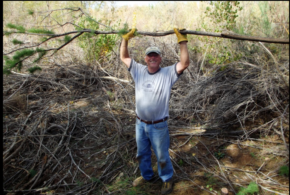
Two Acres of Low Density Tamarisk hand cut and debris clean-up along trail