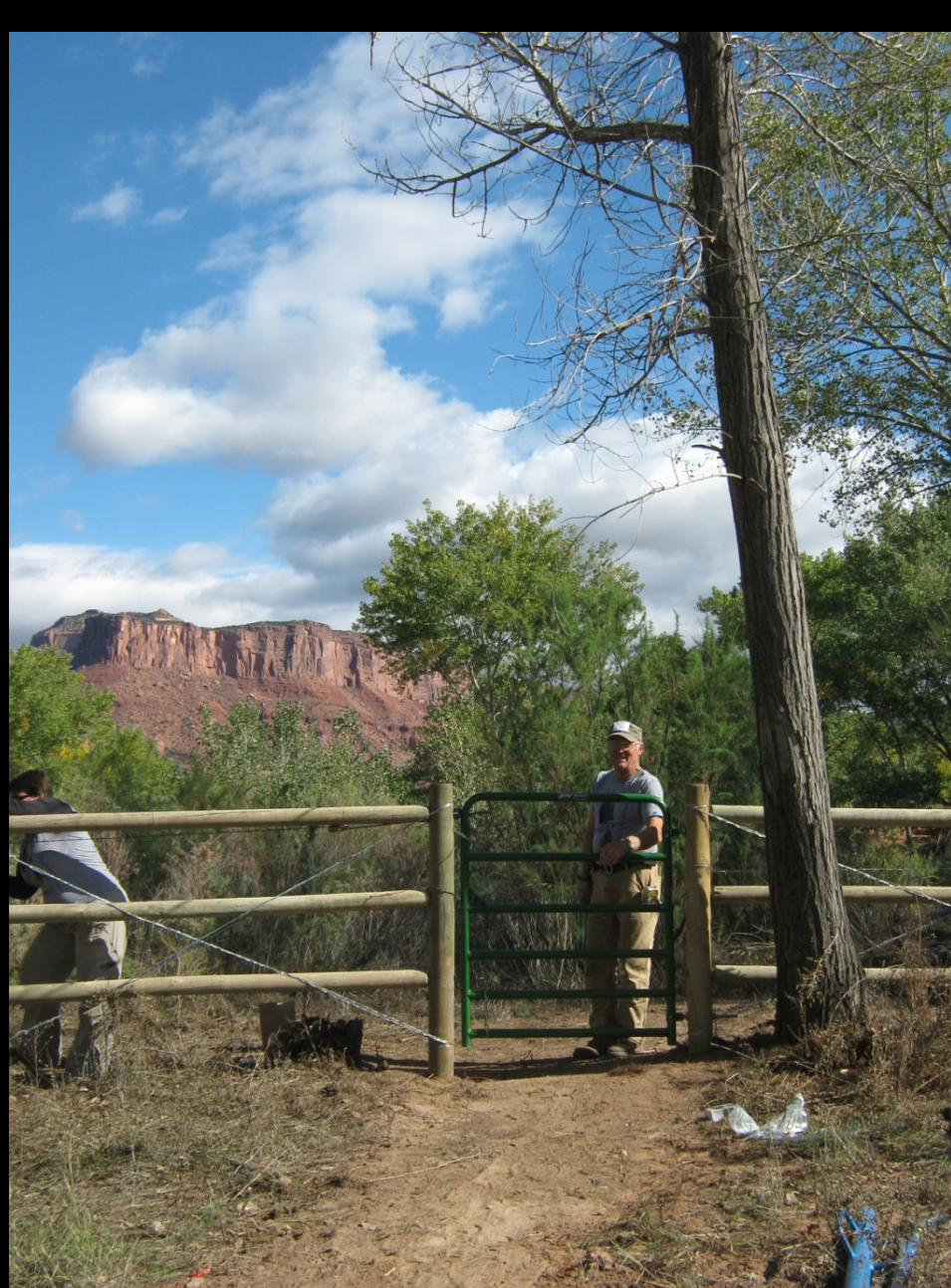
34 feet of Post and Rail Fence, 2 gates