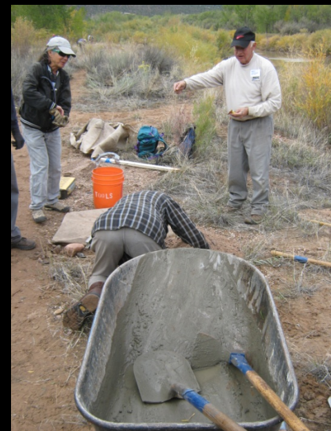
7 sign posts Installed