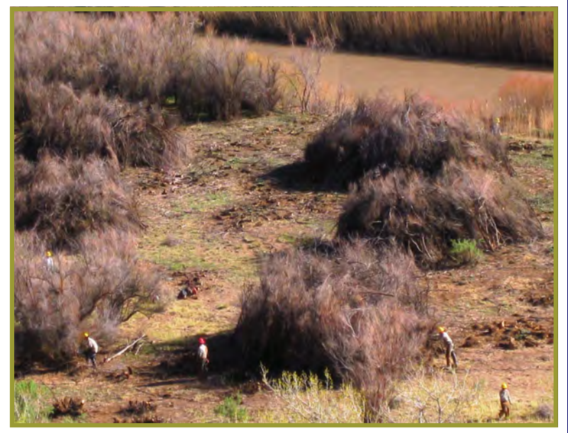
A Conservation Corps crew controls and piles tamarisk along the Big Gypsum stretch of the Dolores River

While we have had many successes on the ground, perhaps the greatest achievement has been the partnership itself. In 2009 we realized that a piecemeal approach toward large landscape restoration along the Dolores was going to be insufficient. Collaboration and shared decision-making across public and private land parcels was necessary to achieve our goals of restoring health to streamside habitat. Today, the DRRP is comprised of local, state, and federal agencies, universities, not-for-profit organizations, landowners, foundations, local businesses and volunteers, all working towards a shared vision of a Dolores River riparian corridor that is more naturally functioning, selfsustaining, diverse, and resilient.