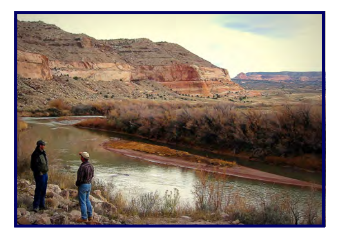
"I'm continuously amazed at how many people care about restoring the vegetation and habitat along the Dolores and am very hopeful about getting my property back to a vital state." — Shane Burton, private landowner, Gateway, CO

Restoration activities have been conducted on 59% of the areas prioritized for active treatments, with initial treatments of tamarisk anticipated to be completed by 2015. Altogether, restoration activities, including tamarisk and Siberian elm removal, spraying of Russian knapweed, and planting or seeding of native plant species that may occur on a given project site, amount to work on 2,544 acres. This does not include the 1,400 acres of riparian habitat designated for passive treatment, in which the tamarisk leaf-beetle, a biological control agent, has substantially defoliated tamarisk.