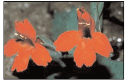
B. Jennings ©1999 Eastwood monkeyflower

The Lower Dolores Management Plan Working Group is working to provide recommendations for updating the Dolores Public Lands Office (Forest Service/BLM) 1990 Dolores River Corridor Management Plan. The Working Group includes diverse stakeholders with many perspectives and interests in the Lower Dolores River Valley. Its goals are to gather information, identify values worthy of protection in the planning area, formulate ideas for protection of the values, and make recommendations to the Dolores Public Lands Office. The Working Group will meet until Fall 2009. Presentations, documents, meeting summaries, agendas and other information related to the Working Group process are posted at http://ocs.fortlewis.edu/drd/.