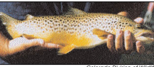
Colorado Division of Wildlife Brown trout